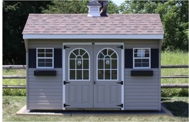
Floor Skid Placement